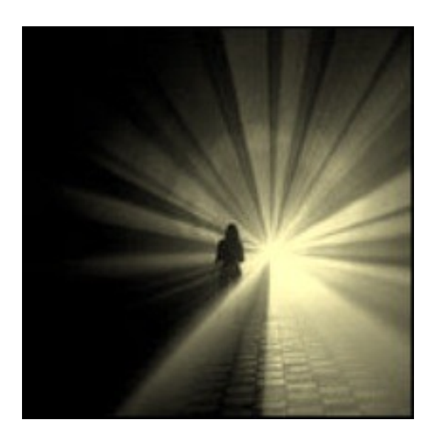
Part 3. How to See the Bright Light at the End of the Tunnel while You're Still Alive

Near-death experiences are indeed the only more or less straightforward glimpse of life after death. Unfortunately, we will now be discussing just that phenomenon. "Unfortunately" because you will have to examine its nature from a completely different point of view. Simply put, it is clear that both out-of-body travel and lucid dreaming are of the same nature as near-death experiences at clinical death. However, the first two somehow fail to prove the existence of an afterlife. They even refute some commonly advanced claims. Before examining the issue, I would like to start by saying upfront that I am not trying to prove that there is no afterlife. I would only like to demonstrate that one of the phenomena associated with the life-after-death issue may possibly be of a wholly other essence and significance.